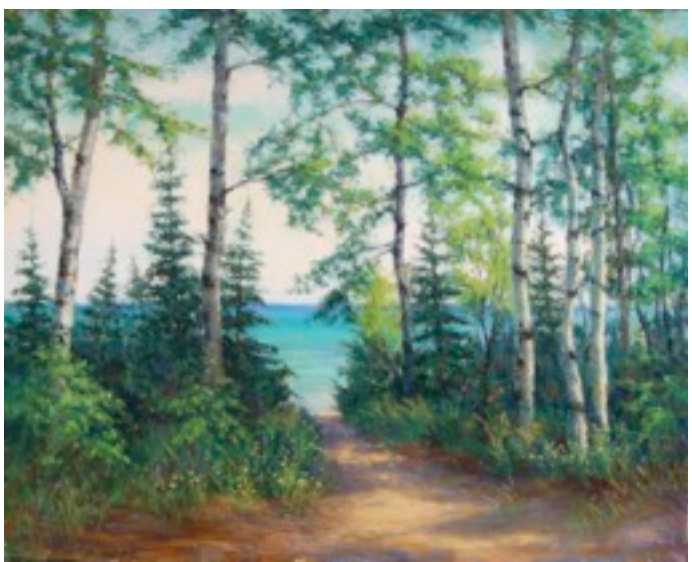
"Birches on Bells Bay" pastel by Kathleen Kalinowski

$135.00 ($108 for HAC members) Learn the basics necessary to paint a beautiful landscape alla prime (all at once) using photo reference. Kathleen demonstrates how to begin a painting including color mixing, composition exercises, brushwork, color temperature, tones and edges. Individual instruction is included as well as a group critique. Students bring their own oil painting supplies. A supply list will be provided upon paid registration. Limited to 10 students. e-mail: <u>kalinowski@chartermi.net</u> Website: <u>www.KalinowskiFineArt.com</u>