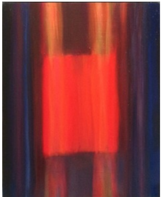
"Portal Series. Number 1" by Robyn Bomhof