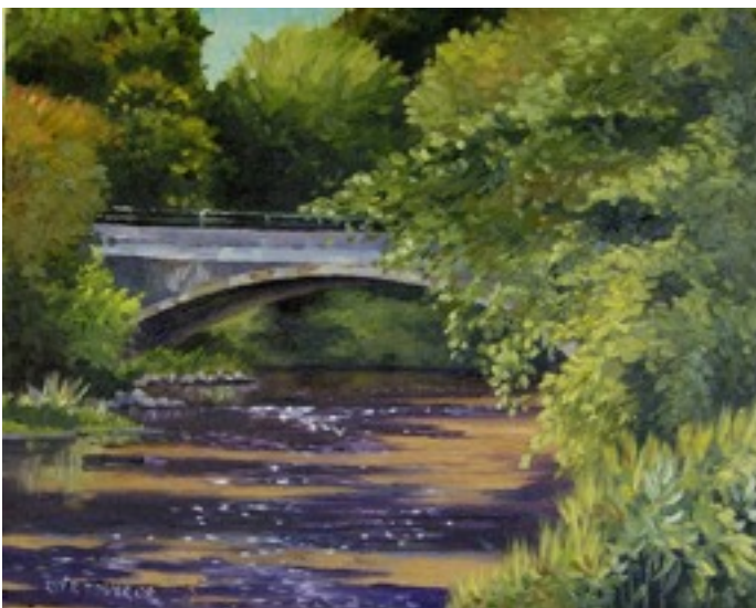
"Island Park" by Rex Tower