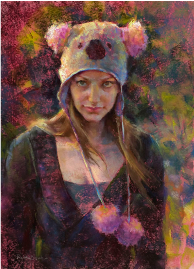
“Koala Games” Pastel