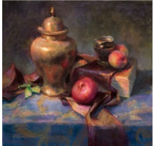
“Golden Flow” Pastel