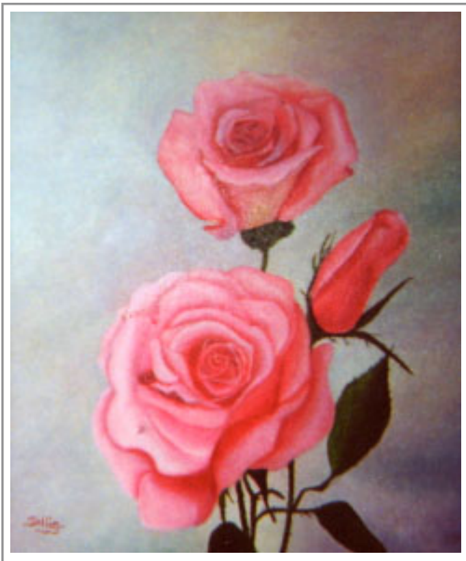
Spring Bouquet by Sallie Zigterman