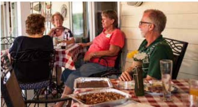
PHOTO GROUP ANNUAL SUMMER PICNIC