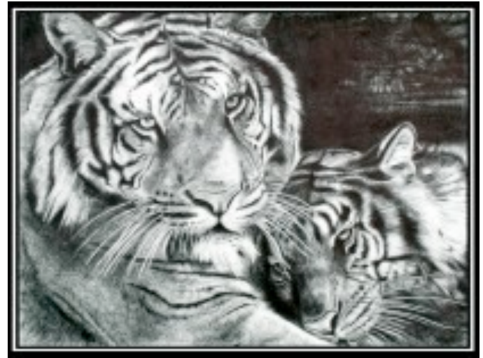
"Peace" by Bonnie Kolarik

48 paintings of great American artists, tracing how they have used landscape imagery to celebrate the beauty of nature and capture its essential role in the American experience.