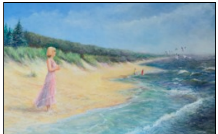
"Beach Mom" by Dave Bazen

"PictureCorrect - Photography Tips and Techniques" http://www.picturecorrect.com