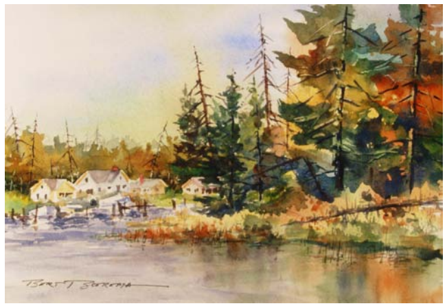
painting by Bert Boerema