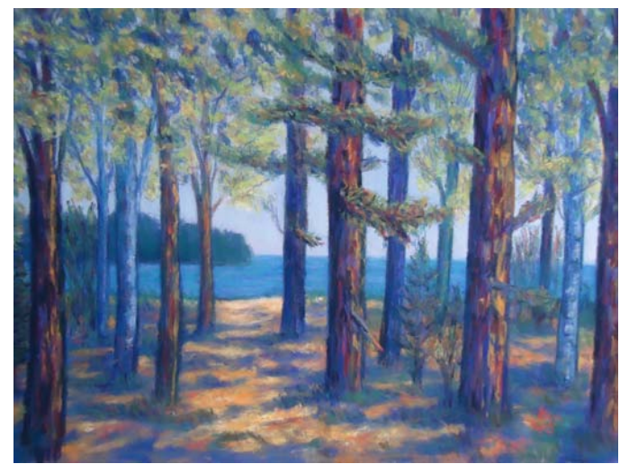
by Kristen Thornton

She will also showing a piece called "Purple Flower Fields at Sunset" at the First United Methodist Church Fall show.