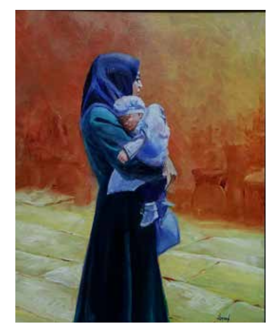
Dave Bazen, "Young Mother in Israel"