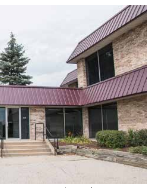
Suite 106, Grand Rapids, MI 40503. d completely renovated to accome.

Many hands make light work. Or at least fun work. Many members showed up to contribute their sweat and muscle power to tearing apart and then rebuilding our new location. So much gratitude for all who helped in any way.