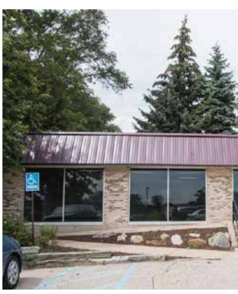
Our future home. 1695 Service Road, Convenient, spacious, full of light, and modate GVA's needs for years to come