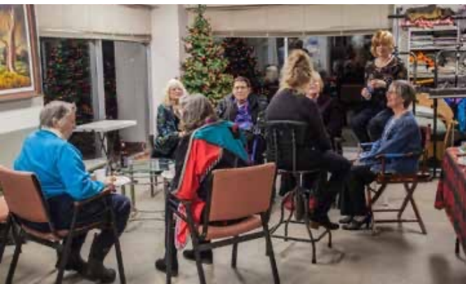
Photos from 2019 GVA Holiday party