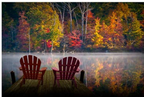
Peaceful Autumn Morning at the Lake