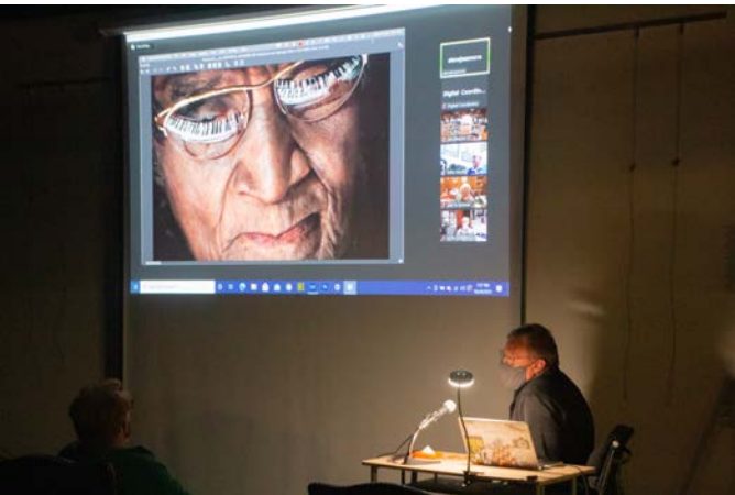
Photo from Grand Rapids Camera Club meeting