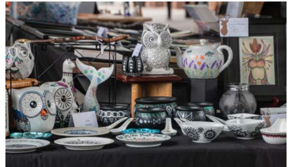
Photos from pop-up market sale