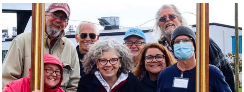
Photo from Estate Sale fundraiser

Thank you again for making this sale a great fundraising event for GVA! These are just a few of the volunteers who were there at the end of the day.