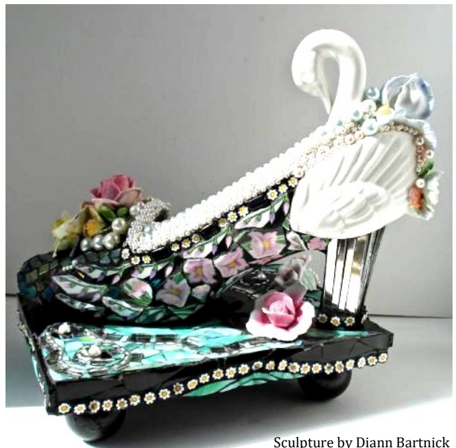
Sculpture by Diann Bartnick

Festival's Artisan Village together with the Lowell Arts' Fallasburg Arts Festival encourages everyone to shop fine art and craft this coming fall. For more information visit Fallasburg Arts Festival .