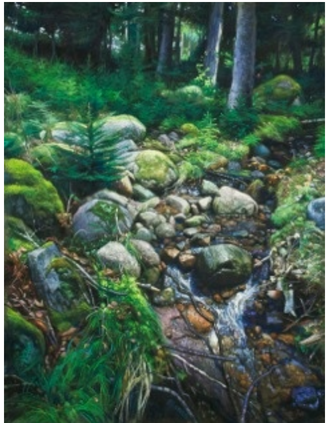
"Trickle Down Effect" pastel, 24" x 18" by Larry Blovits