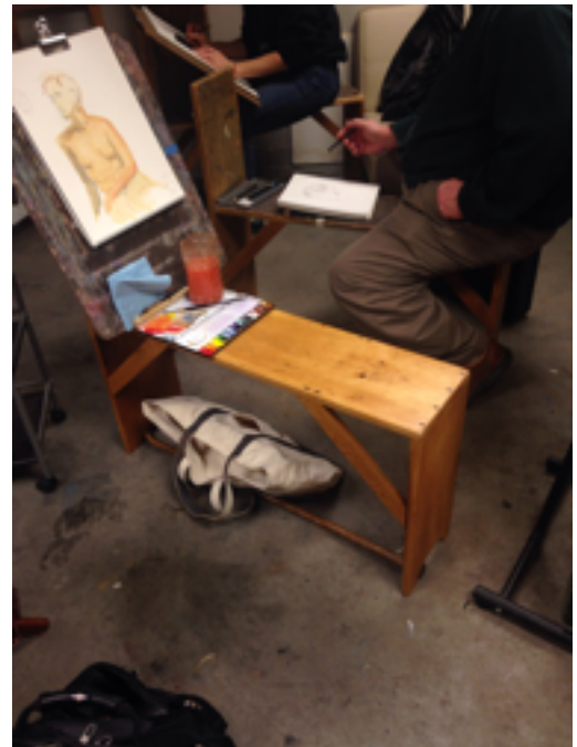
Refurbished bench - already in use!