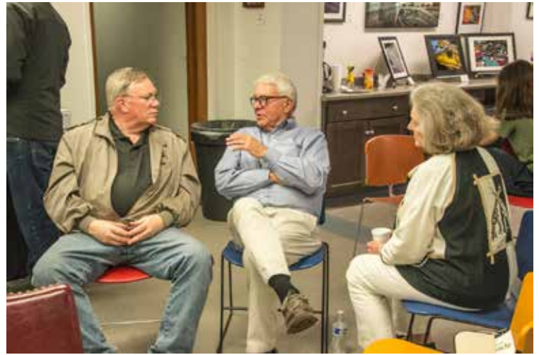
PHOTO GROUP RECEPTION 2019