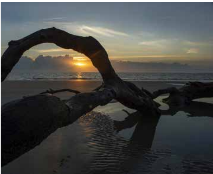
Sunrise Driftwood Beach