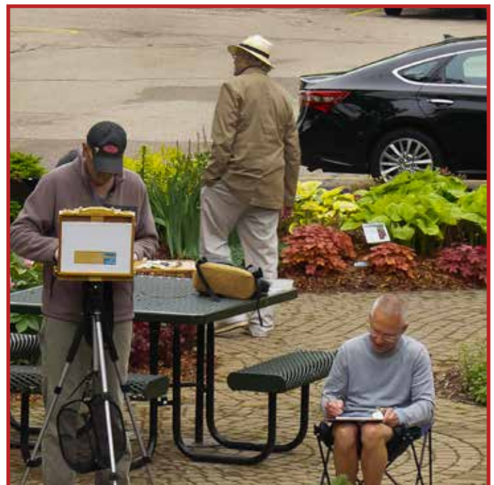
The Mystery Men. Or not.

Another "upside" to painting with GVA friends is that they like to hang out after painting. We usually find a