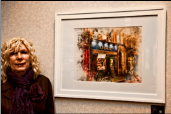
"The Creperie"

The next show will feature a variety of GVA artists and will open on, or about January 15th and run through March 15th.