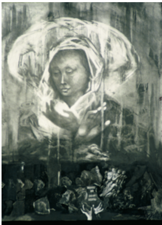
“Black Madonna” graphite mixed media by Robyn Bomhof