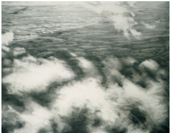
“Resting Place” graphite by Robyn Bomhof