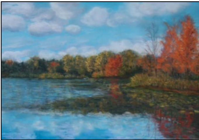
"East Lake in Autumn" by SaraBeth Carr

Reception: April 13, 1 - 4 pm Gallery Hours: Mon. - Thurs. 8 am to 8 pm Friday 8 am to 8 pm Sat. & Sun. 8 am to 6 pm Address: 2025 Fulton Grand Rapids, MI