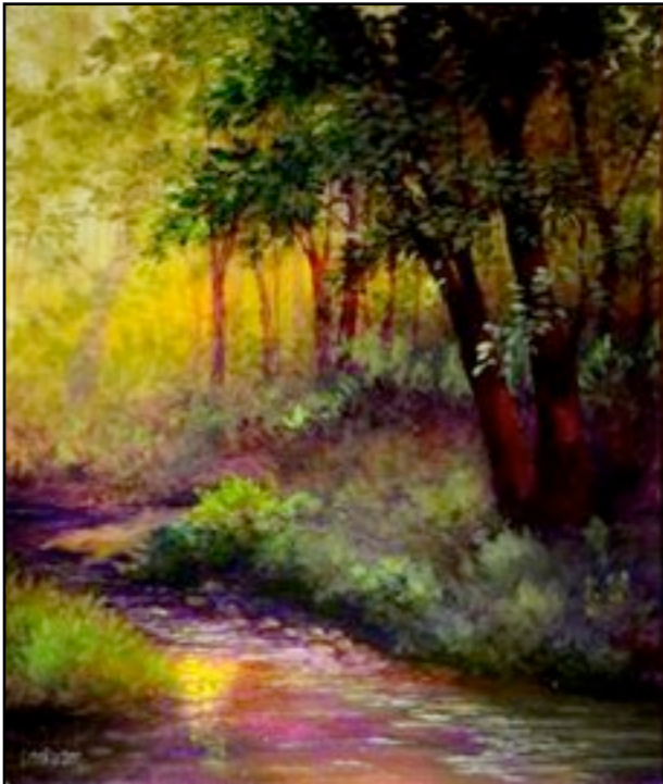
by Al Cianfarani