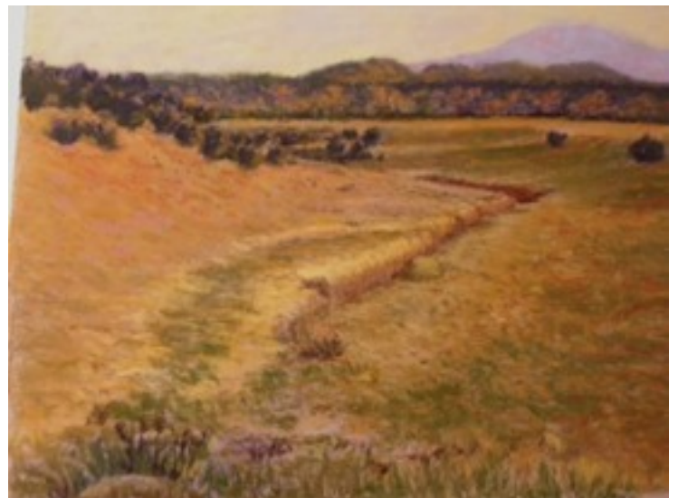
"The Arroyo" by SaraBeth Carr