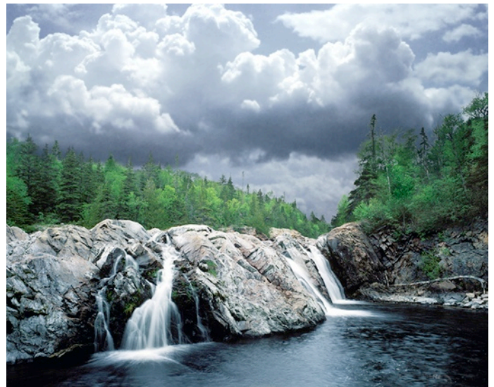
"Ontario Falls"