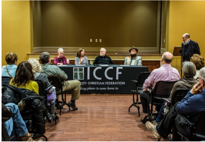
Panel discussion at ICCF reception