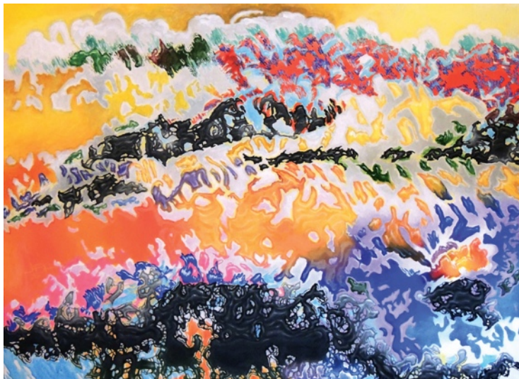
"First Light" by Jon Hunter

Grand Rapids Public Museum 272 Pearl Street NW Grand Rapids, MI 49504 Hours: Tue. 9:00 AM - 8:00 PM Wed - Sat 9:00 AM - 5:00 PM