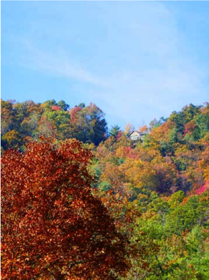
Autumn colors in Tennessee, captured by Linda.

the area where simple farmers carved out a life in the middle of this incredible beauty. Such hardships they endured! We documented our trip with photos. It's always hard to juggle taking a family shot one second and an artistic shot the next, but we are learning how to do it successfully.