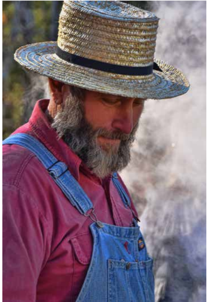
These two photos by Steve, a farmer making molasses above and a grist mill below, take the viewer back in time.

Driving through mountainous areas is very tiring because of all the winding switchbacks, but the views of mountains, buildings and wildlife are worth it as long as one takes a few breaks. If you ever have a chance, visit the Smoky Mountains. You will enjoy it!