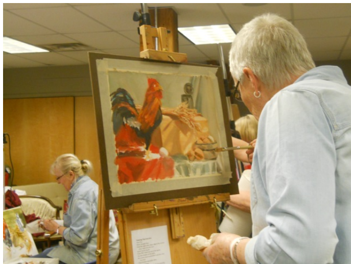
Wednesday Still Life Painting

Artists' reception will be Thursday, May 9 from 7:00 pm to 9:00 pm.