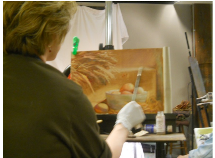
Wednesday Still Life Painting Session