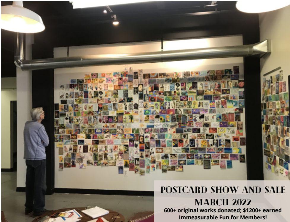
POSTCARD SHOW AND SALE MARCH 2022 600+ original works donated; $1200+ earned Immeasurable Fun for Members!