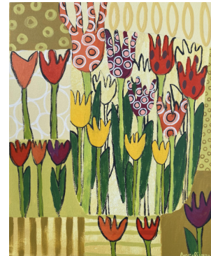
Tulip Fields , Anne Rivers

To learn more, visit tuliptime.com/first-bloem-2022 .