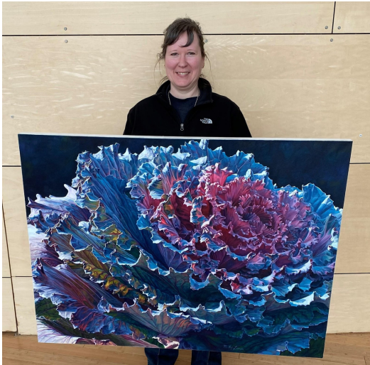
Ornamental Cabbage, M. Joy Lemon