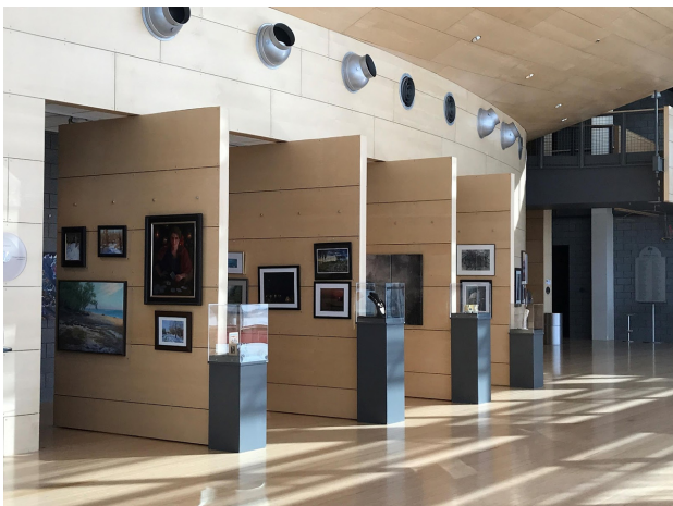
Forest Hills Fine Arts Center