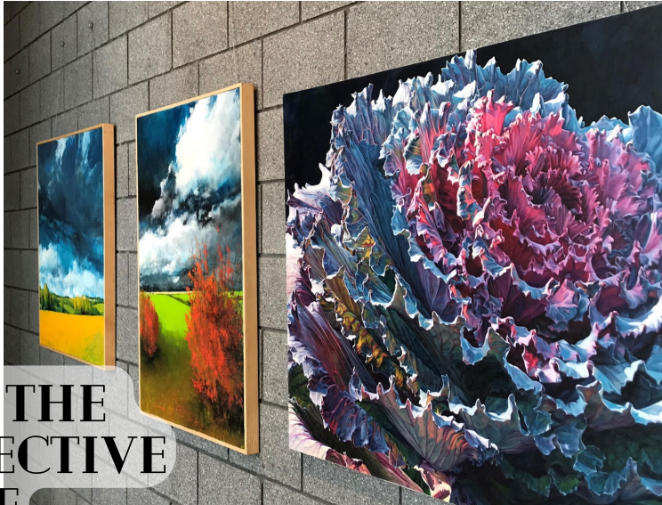
Various Artwork, Forest Hills Fine Arts Center